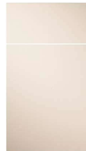
BAYSIDE Coastal White Melamine