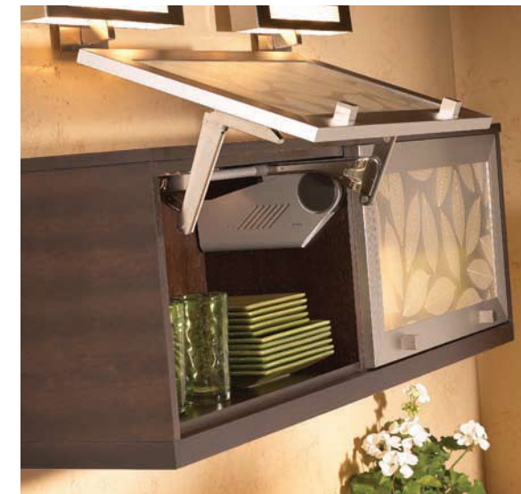
Easy-opening up and over lift system will ensure easy access to cabinet interior. Door remains open in any desired position.

Accuracy of reproduced color is subject to printing limitations. Please review actual color samples and displays before selecting a finish.