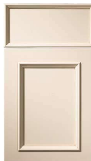
BRITTANY Coastal White Enamel/Sable Glaze