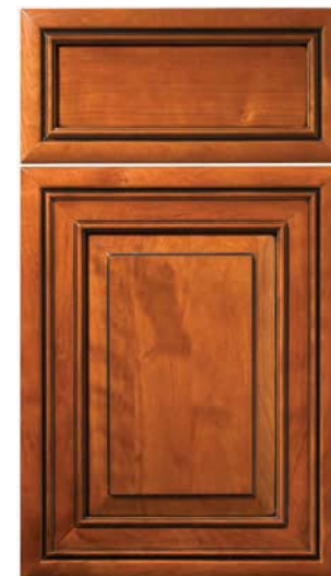
GEORGETOWN Cherry, Clove/Black Glaze