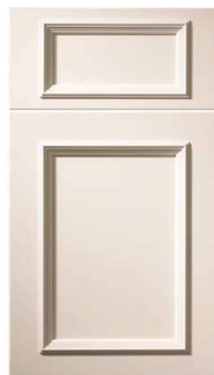
SOMERLAKE Designer White Enamel