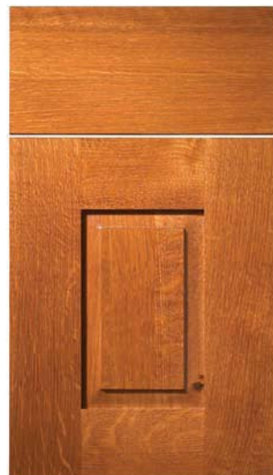
FRESNO Quarter Sawn White Oak, Clove