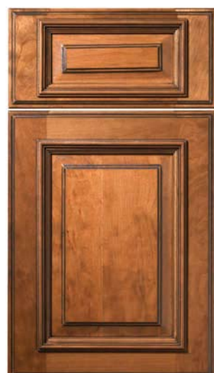
WORTHINGTON Cherry, Walnut/Black Glaze