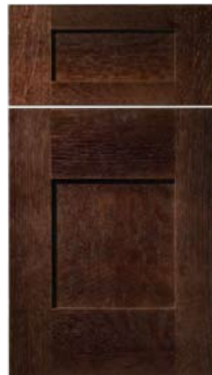
PACIFICA Quarter Sawn White Oak, Espresso