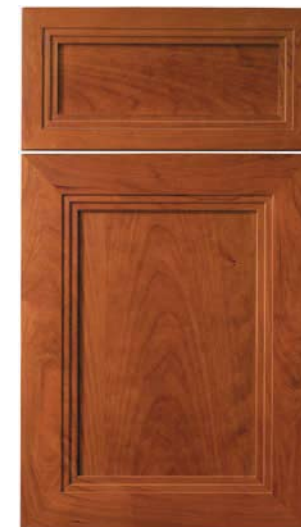
PROVENCE Cherry, Ginger