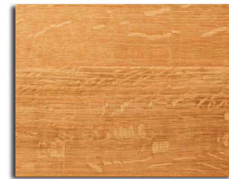
QUARTER SAWN WHITE OAK

For you to fully appreciate the natural characteristics of our wood species, these samples are shown with a natural finish.