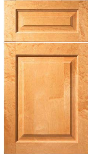
PORTLAND Maple, Allspice