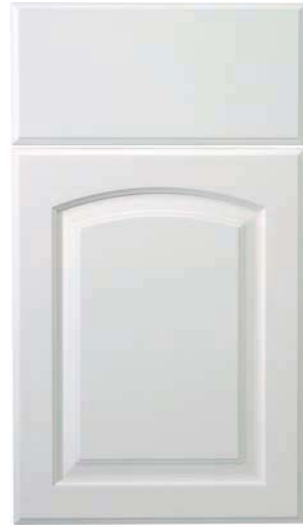
WAKEFIELD Coastal White Enamel

CASTPOINTE FRAMELESS CABINETRY styles and finish options stand on their own beautiful merits. And they also complement or match all of Woodharbor's other lines of Cabinetry & Doors.