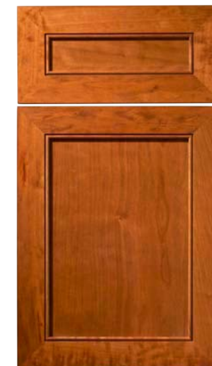
ASHLAND Cherry, Clove