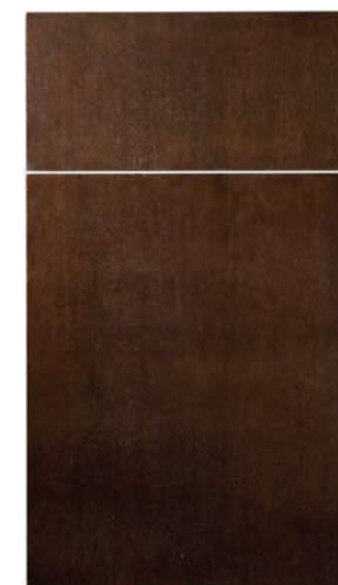
MONTEREY Quarter Sawn White Oak, Espresso