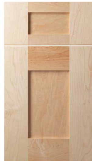
BARSTOW Maple, Natural