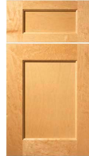
SEABROOK Maple, Butternut