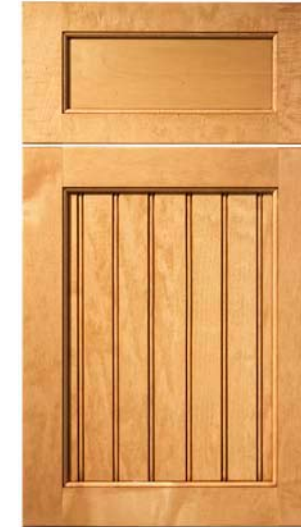
PENNINGTON Maple, Butternut/Chocolate Glaze