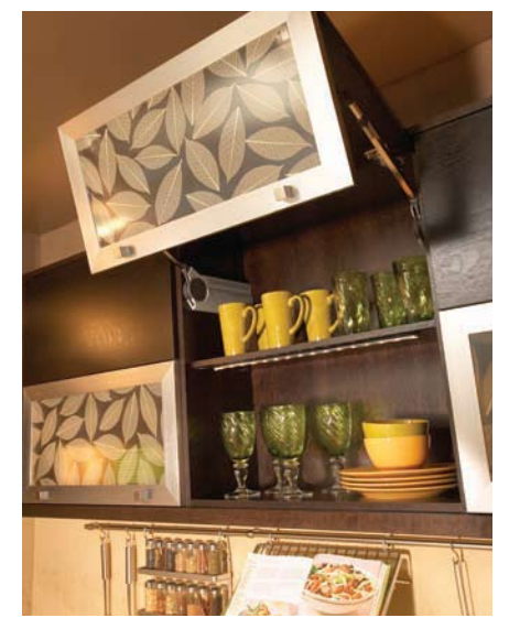
Easy-opening bi-fold door lift system features effortless door closure system. Doors remain in position.