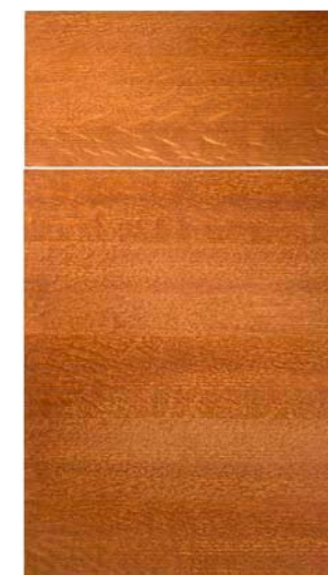
RIVERSIDE Quarter Sawn White Oak, Clove