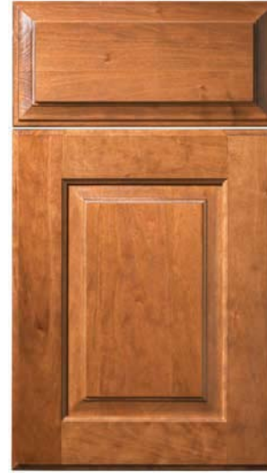
WATERBURY Cherry, Walnut