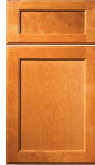
MADISON Cherry, Pecan