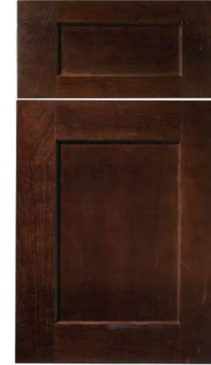
CHELSEA Cherry, Espresso