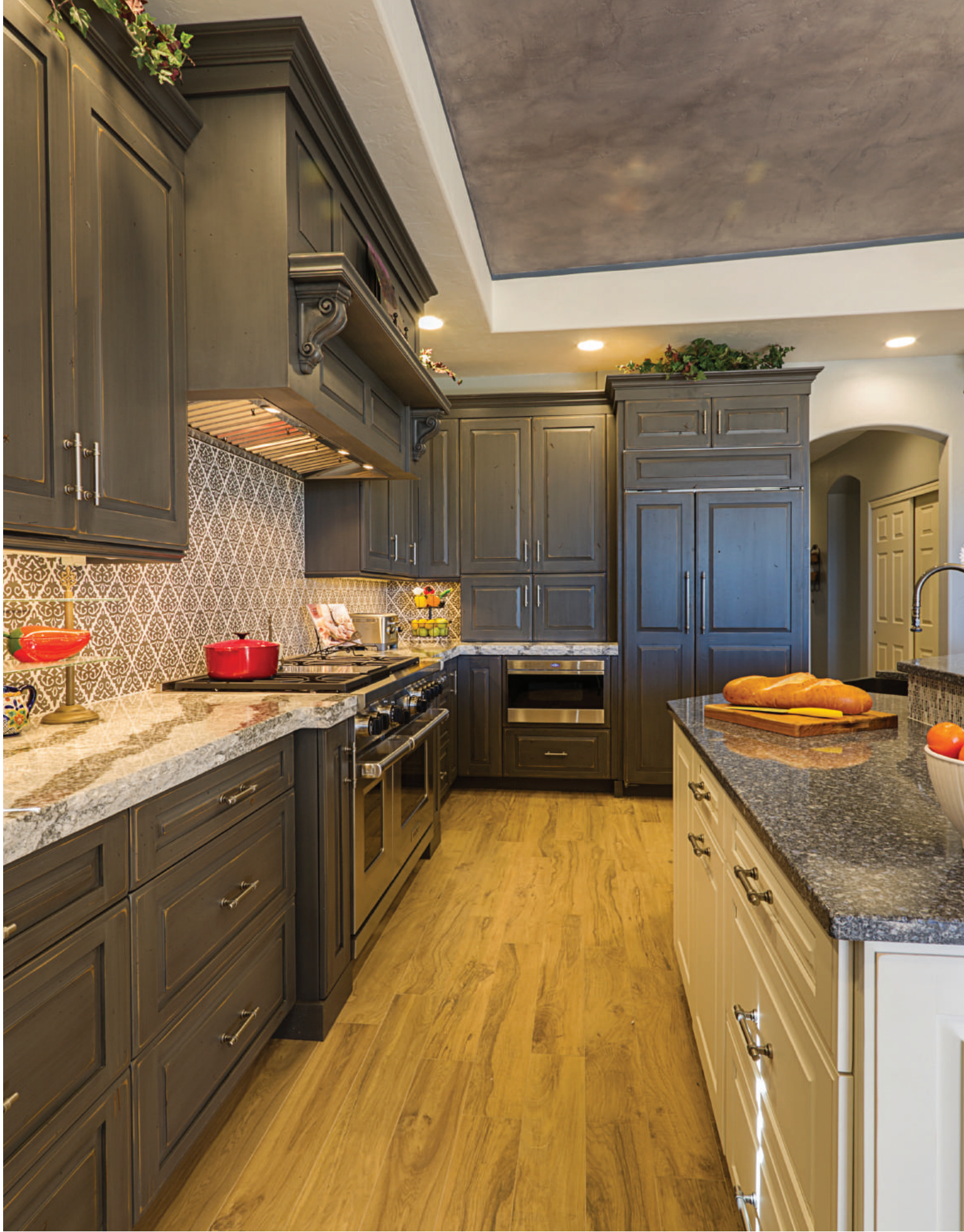
Portsmouth door, D-edge shape, Manor Raised drawer, Knotty Alder, Sawyer Smoke Stack Island: Portsmouth door, D-edge shape, Manor Raised Drawer, Maple, Heritage White