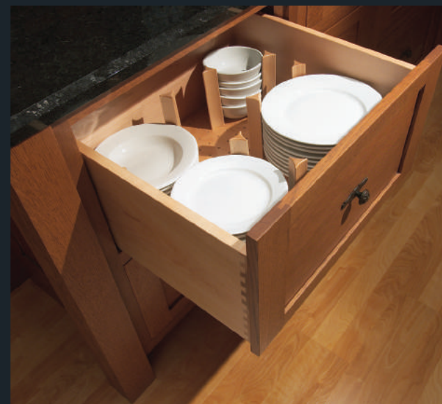
Dish Drawer Organizer