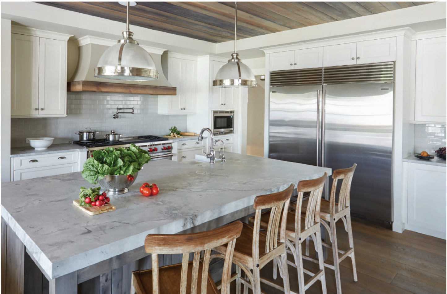
Perimeter Cabinetry: Oxboro door, A-edge shape, Manor Flat front, Maple, White Dove Island: Oxboro door, A-edge shape, Manor Flat drawer, Knotty Alder, Weathered Silverwood