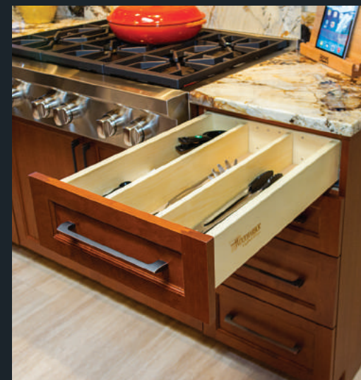
Adjustable Drawer Partitions