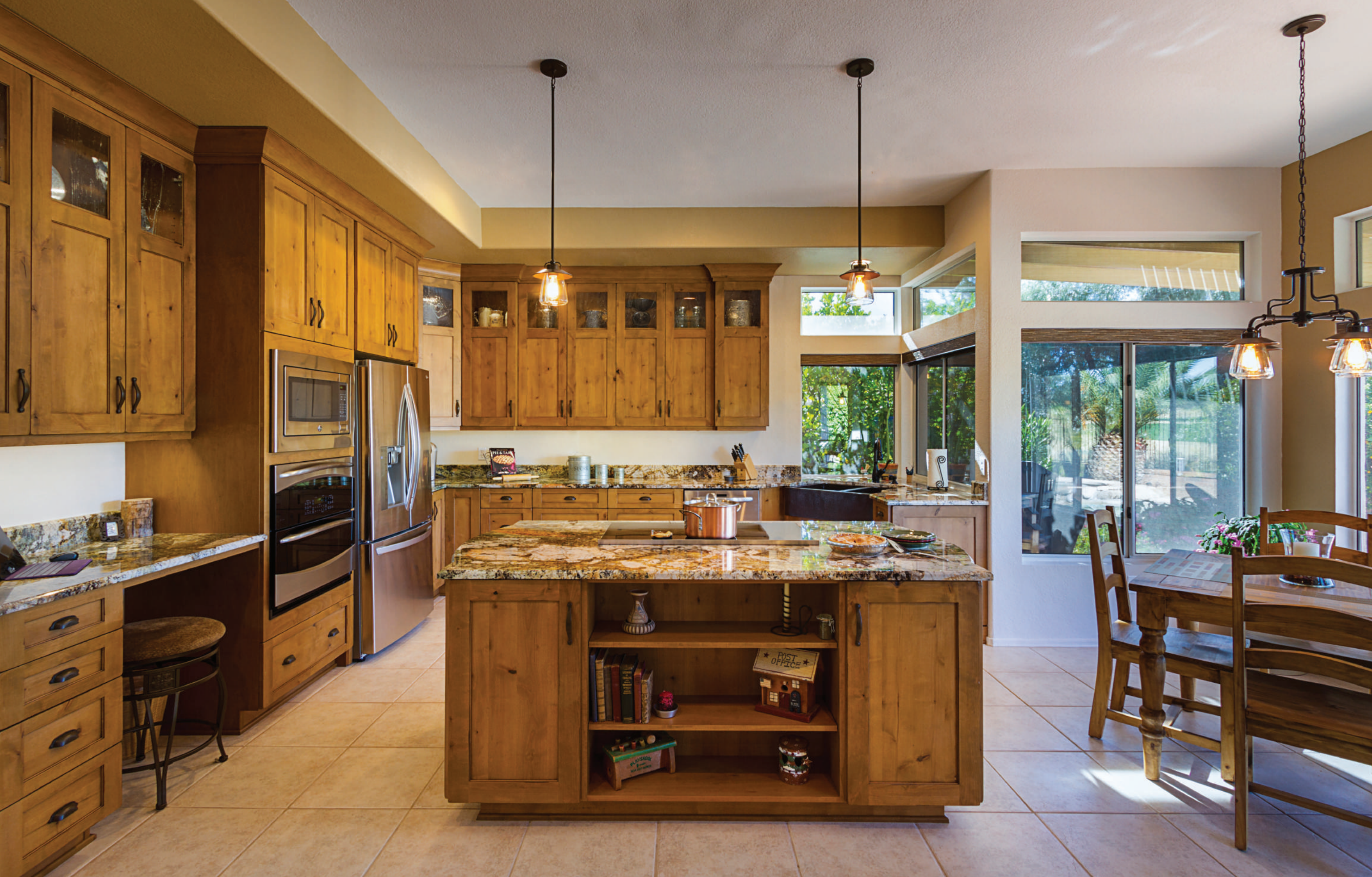
Seabrook door, S-edge shape, Manor Flat drawer, Knotty Alder, Rustic Timber (Frameless)