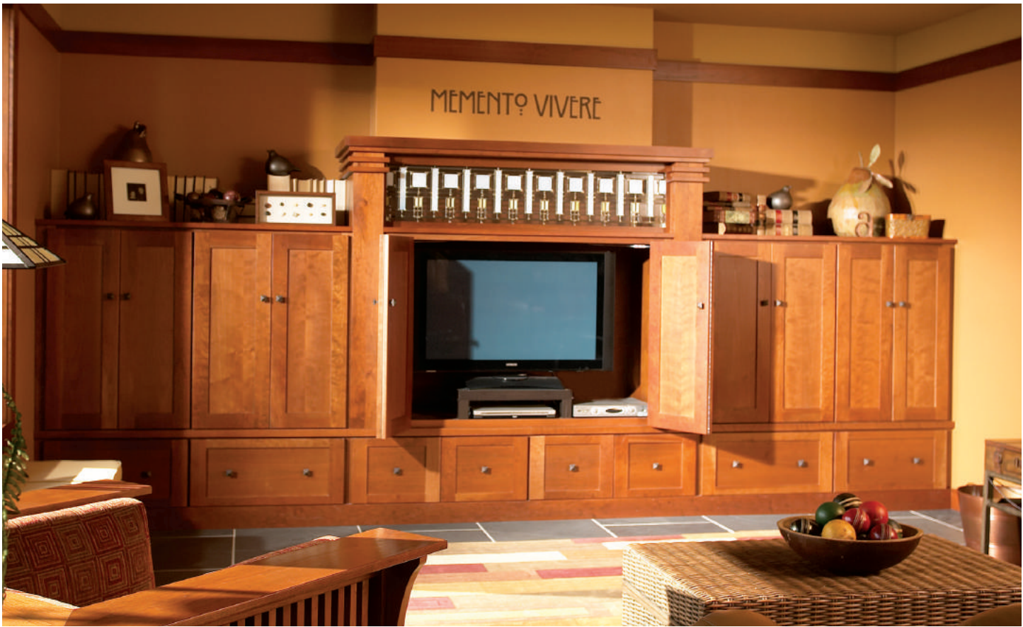
Seabrook door, Prairie profile, S-edge shape, Manor Flat drawer, Cherry, Clove