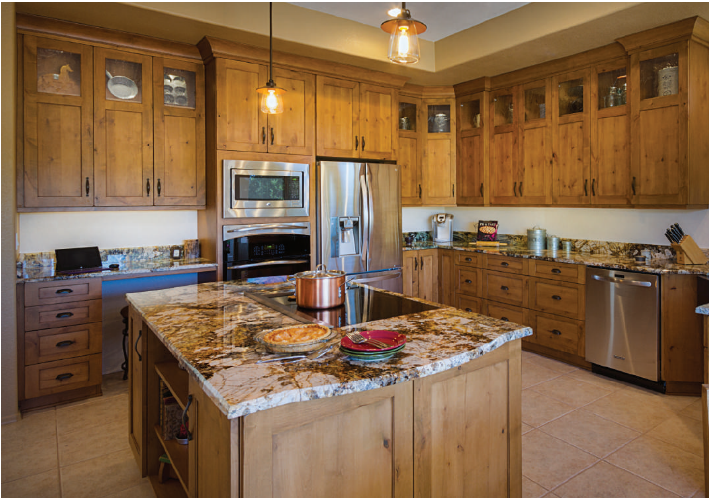
Seabrook door, S-edge shape, Manor Flat drawer, Knotty Alder, Rustic Timber