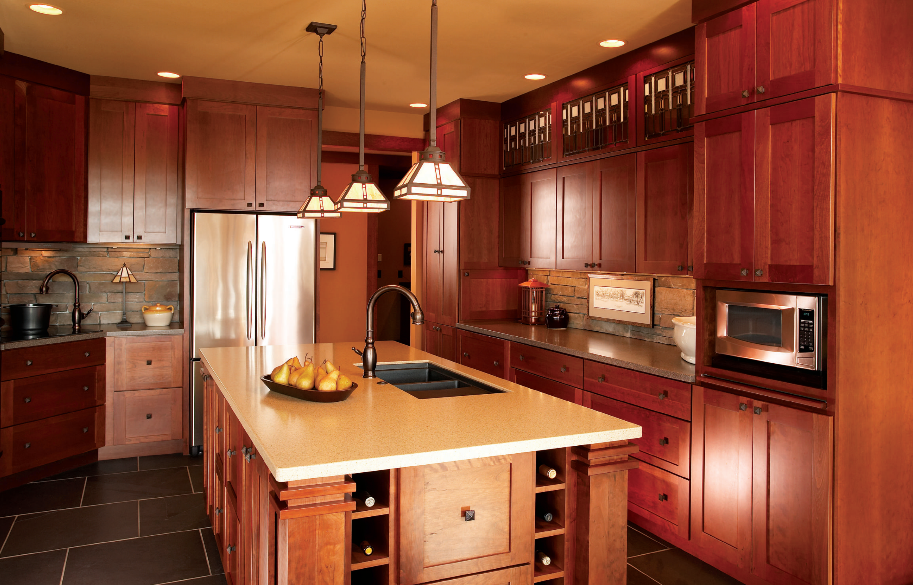
Seabrook door, Prairie profile, S-edge shape, Manor Flat drawer, Cherry, Clove (Full Overlay)