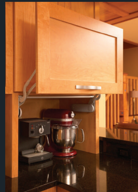
Appliance Garage Lift Up System