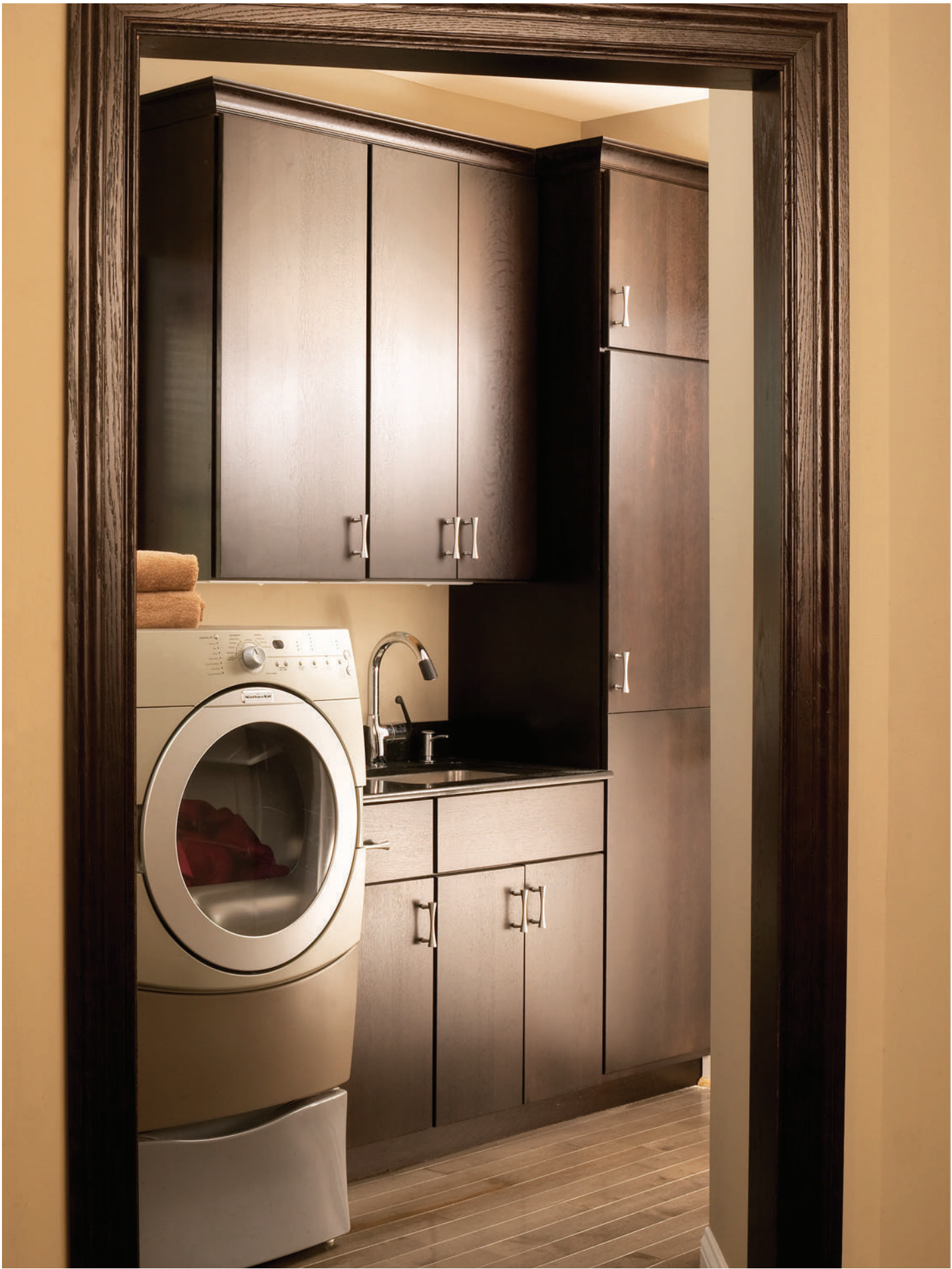
Cameron door, A-edge shape, Slab drawer, Quarter Sawn White Oak, Espresso