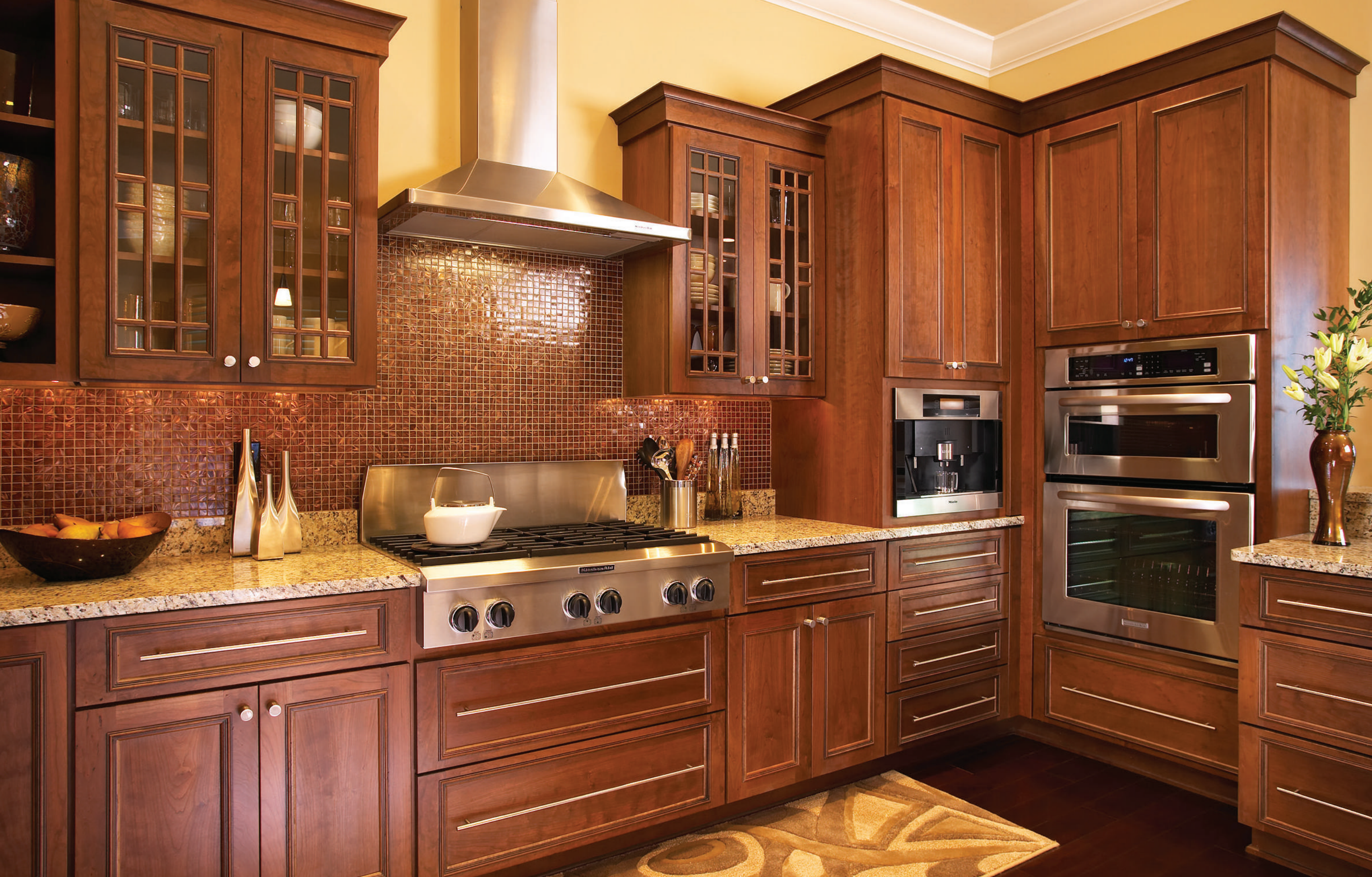
Somerlake door, Standard Hip profile, A-edge shape, Manor Flat drawer, Cherry, Walnut/Black Glaze (Full Overlay)

Design by: Mike May, Woodharbor Design Showroom