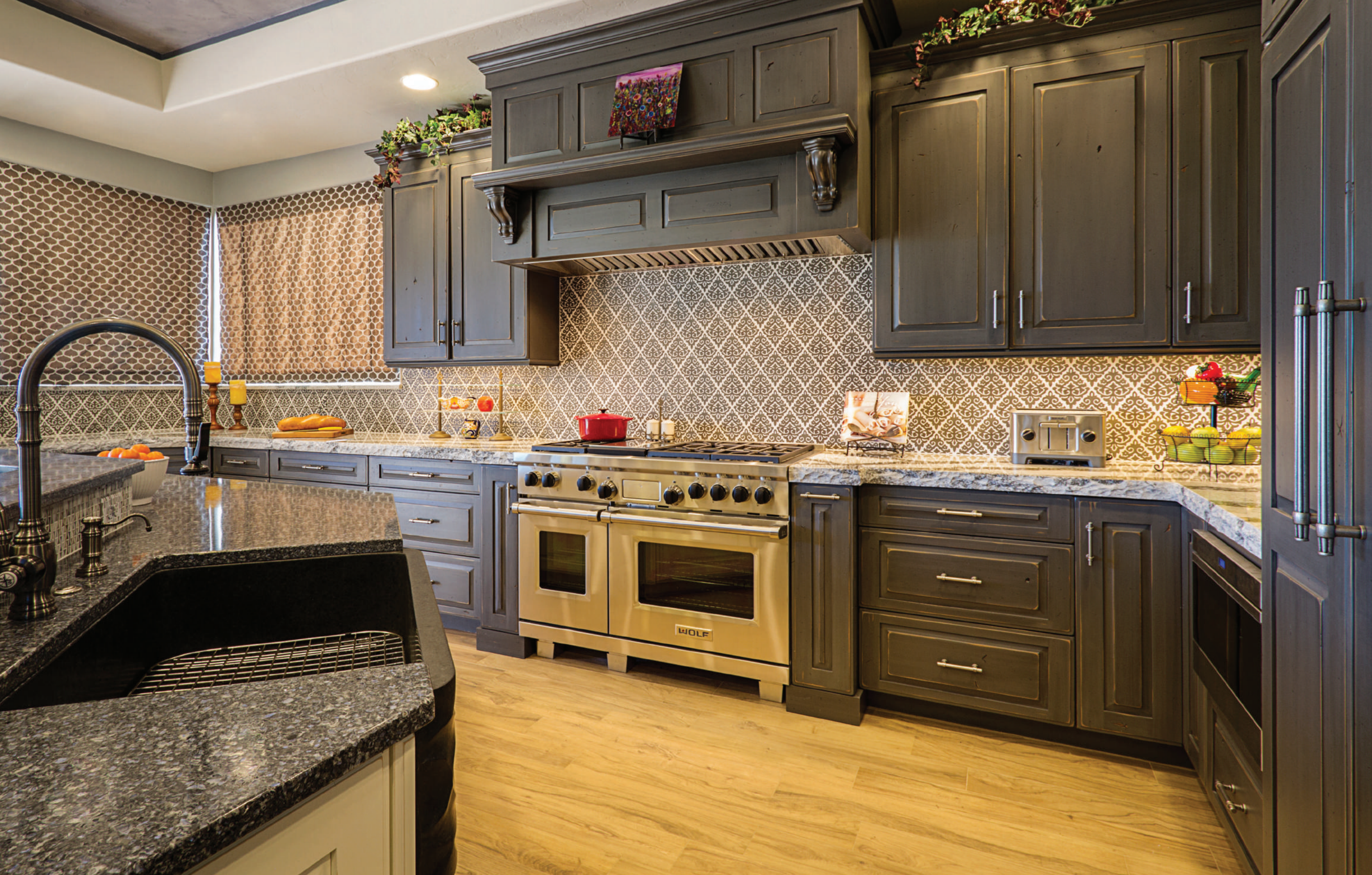
Portsmouth door, D-edge shape, Manor Raised drawer, Knotty Alder, Sawyer Smoke Stack (Frameless)