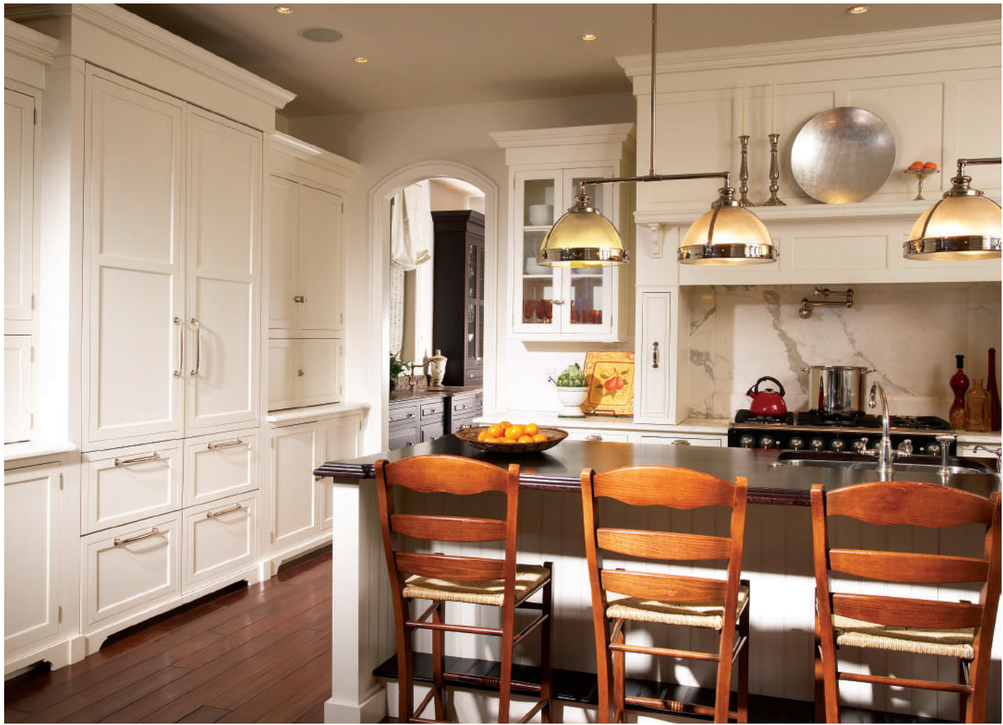
Madison door, Standard Hip profile, A-edge shape, Manor Flat drawer front, Coastal White