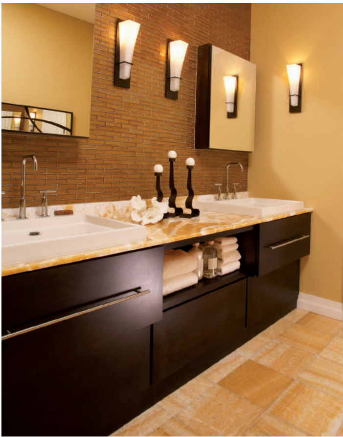
Cameron door, A-edge shape, Slab drawer, Cherry, Espresso