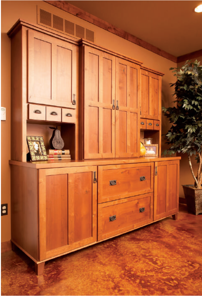
Seabrook door, Prairie Profile, A-edge shape, Manor Flat drawer, Knotty Alder, Clove