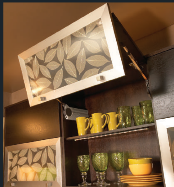
Bi-Fold Flip Up Lift System