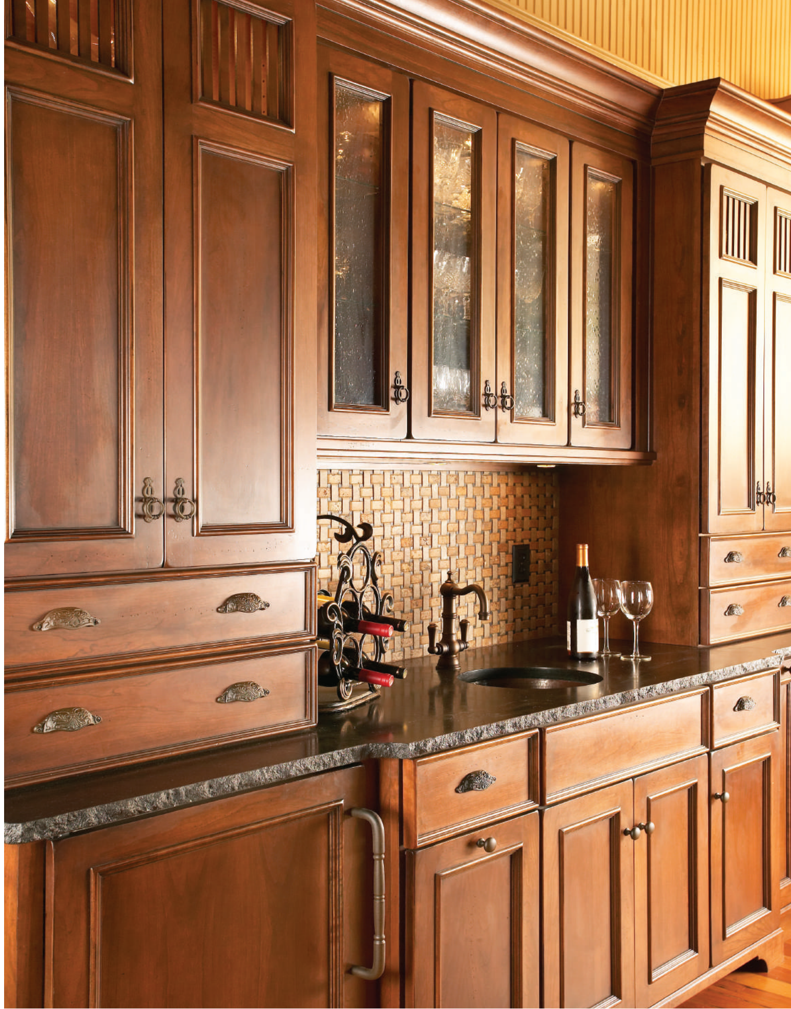
Nottingham and Brittany doors, A-edge shape, Brittany Styled drawer, Cherry, Rustic Chestnut (Full Overlay)