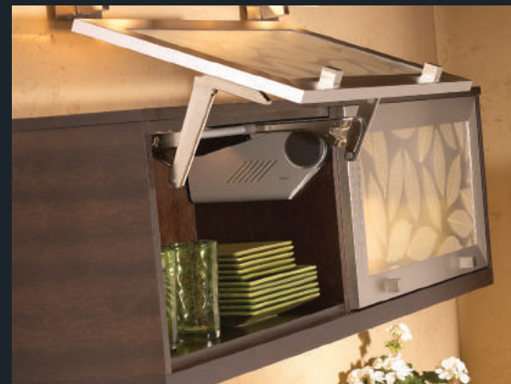
Up and Over Lift System