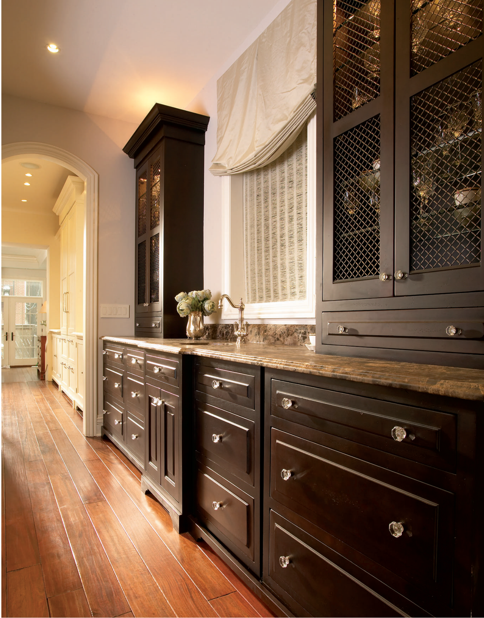
Chateaux door, A-edge shape, Classic drawer, Cherry, Espresso (Flush Inset)