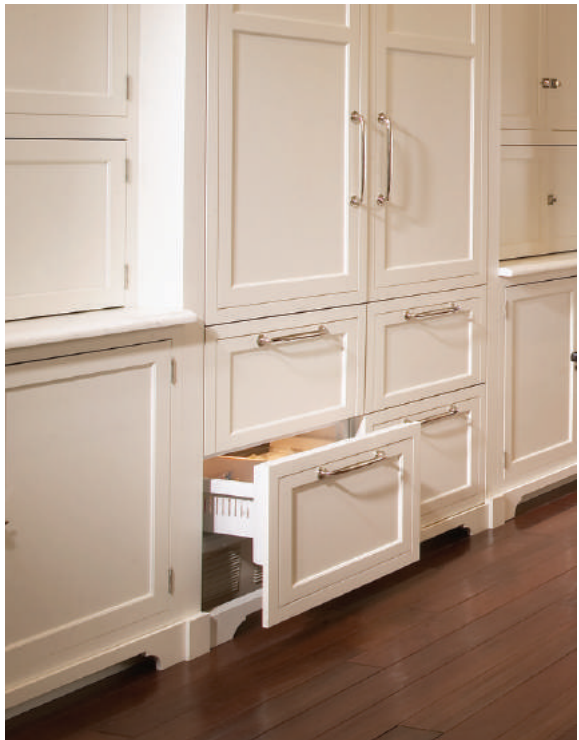
Integrated Appliance Panels