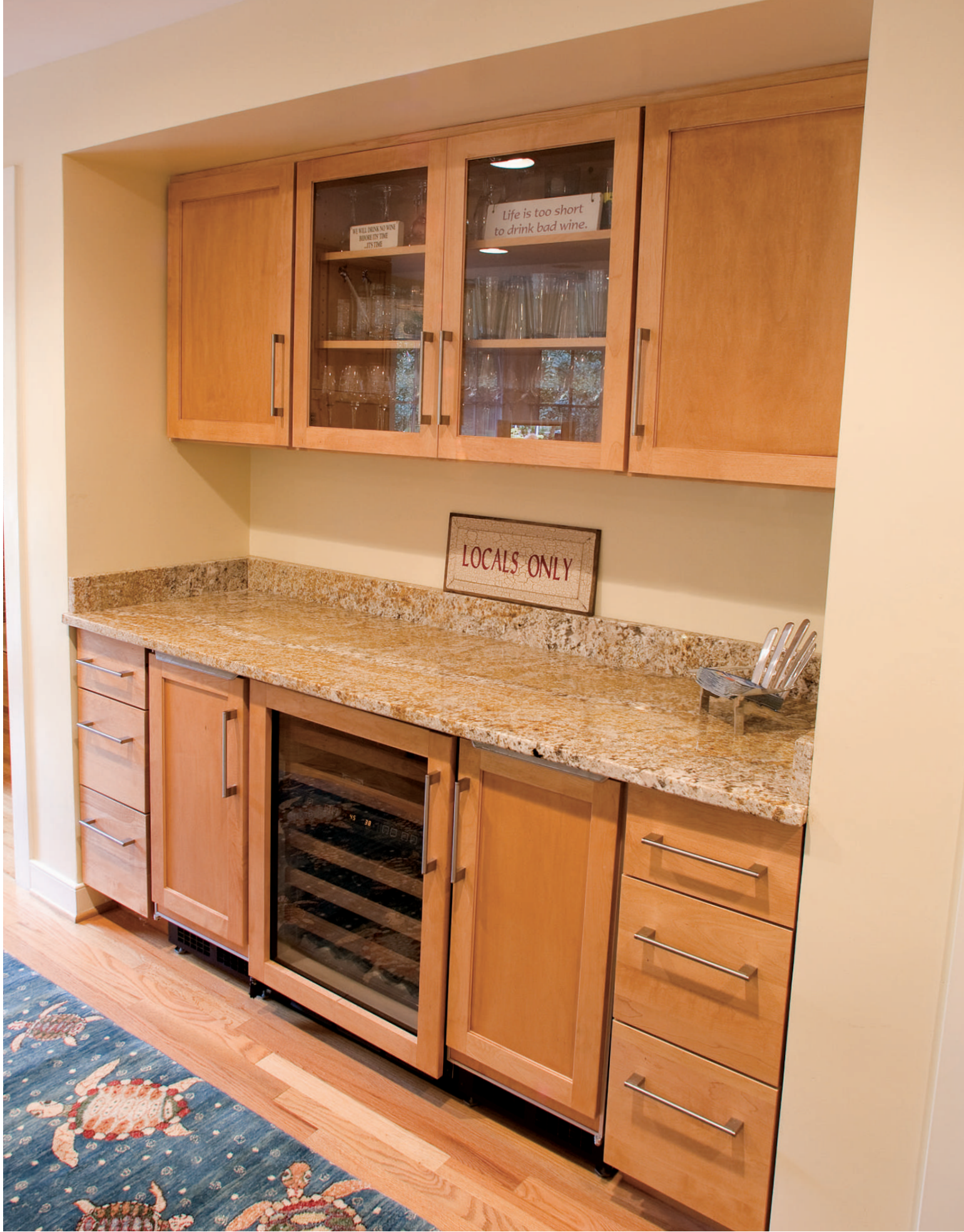
Madison door, A-edge shape, Slab drawer, Maple, Honey