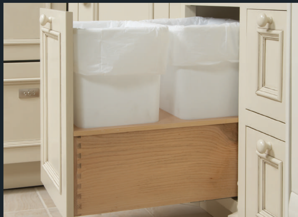
Double Roll-Out Waste