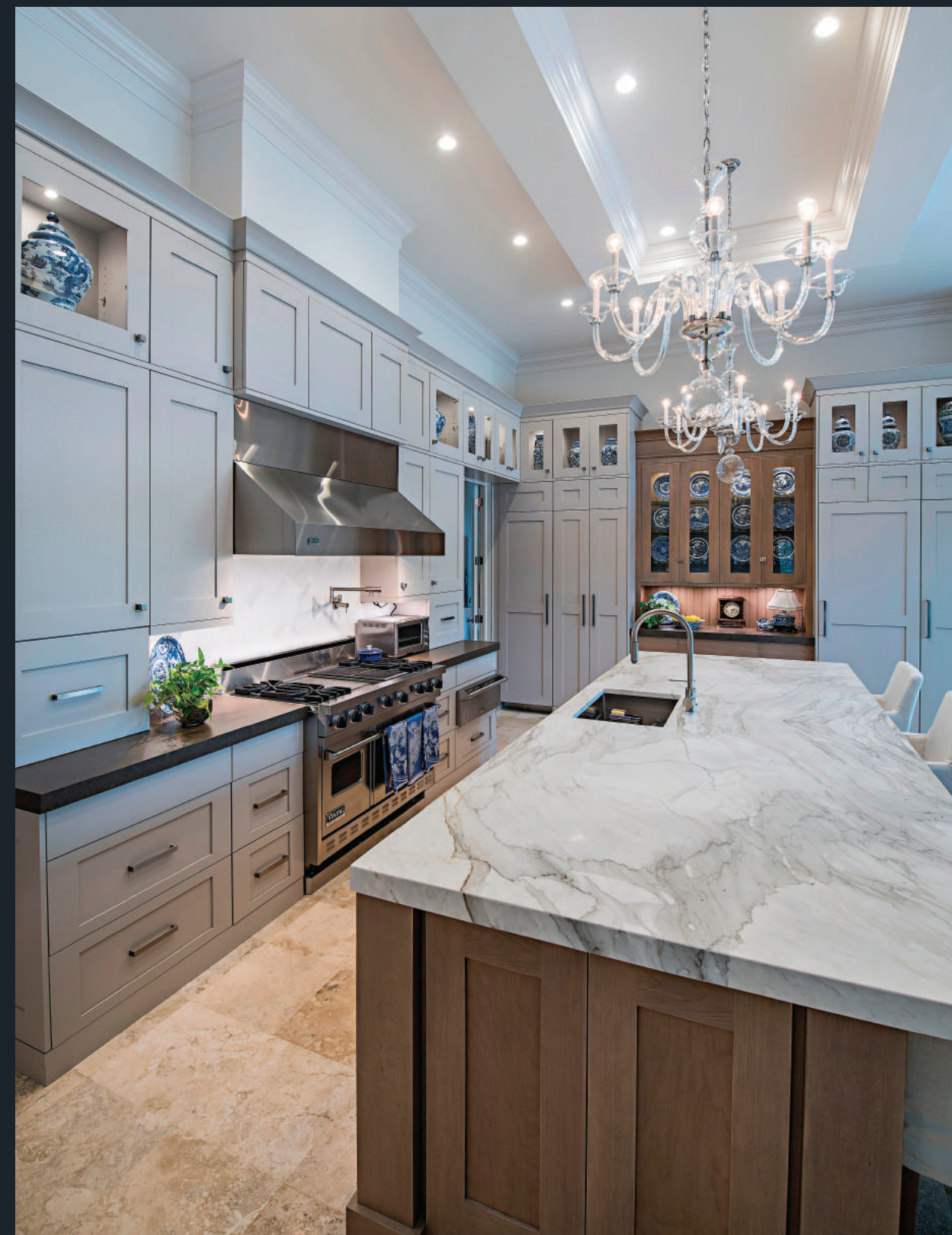
Barstow door, S-edge, Manor Flat and Slab Drawers, Paintable, Custom Finish (Frameless)