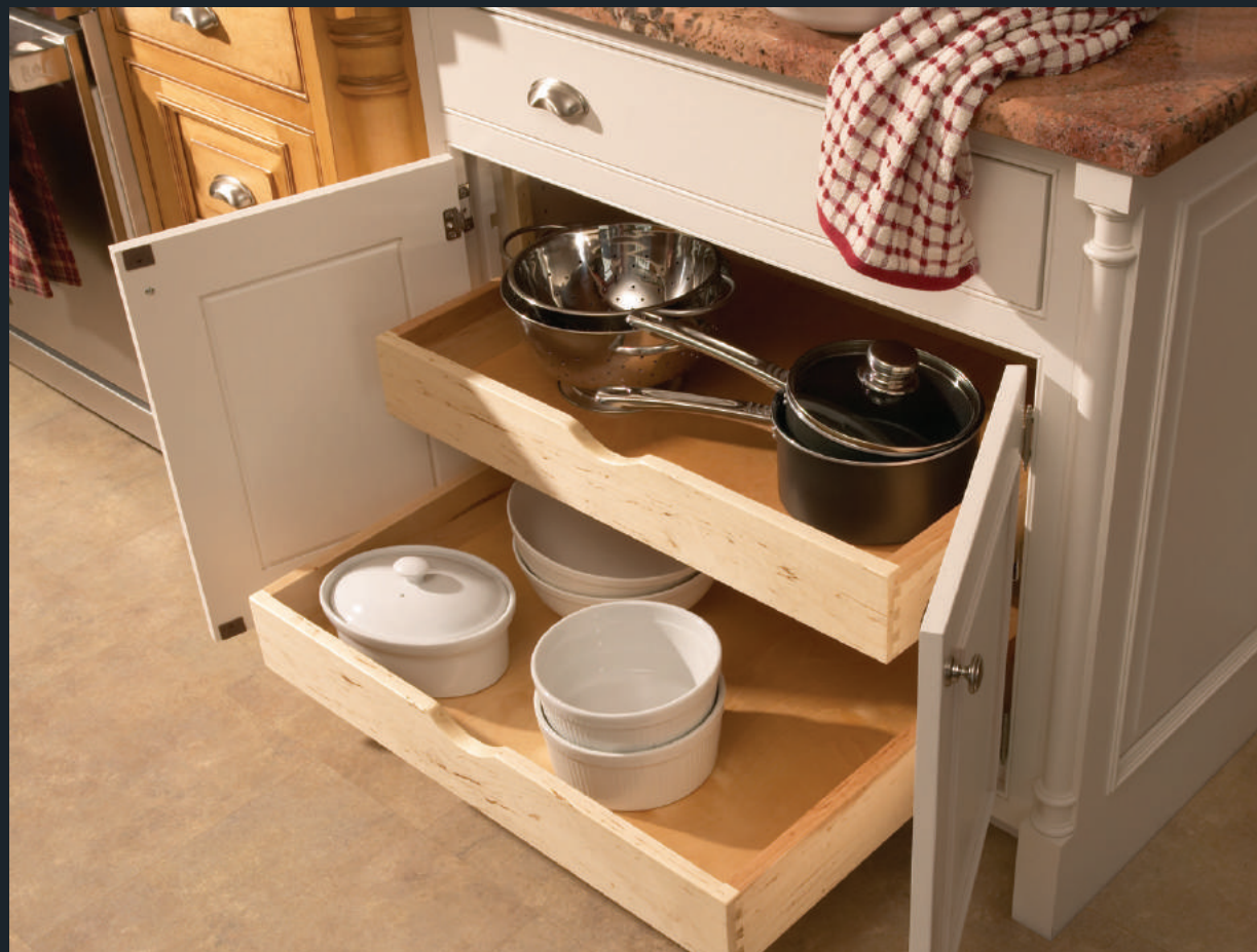
Maple Roll-Out Shelves