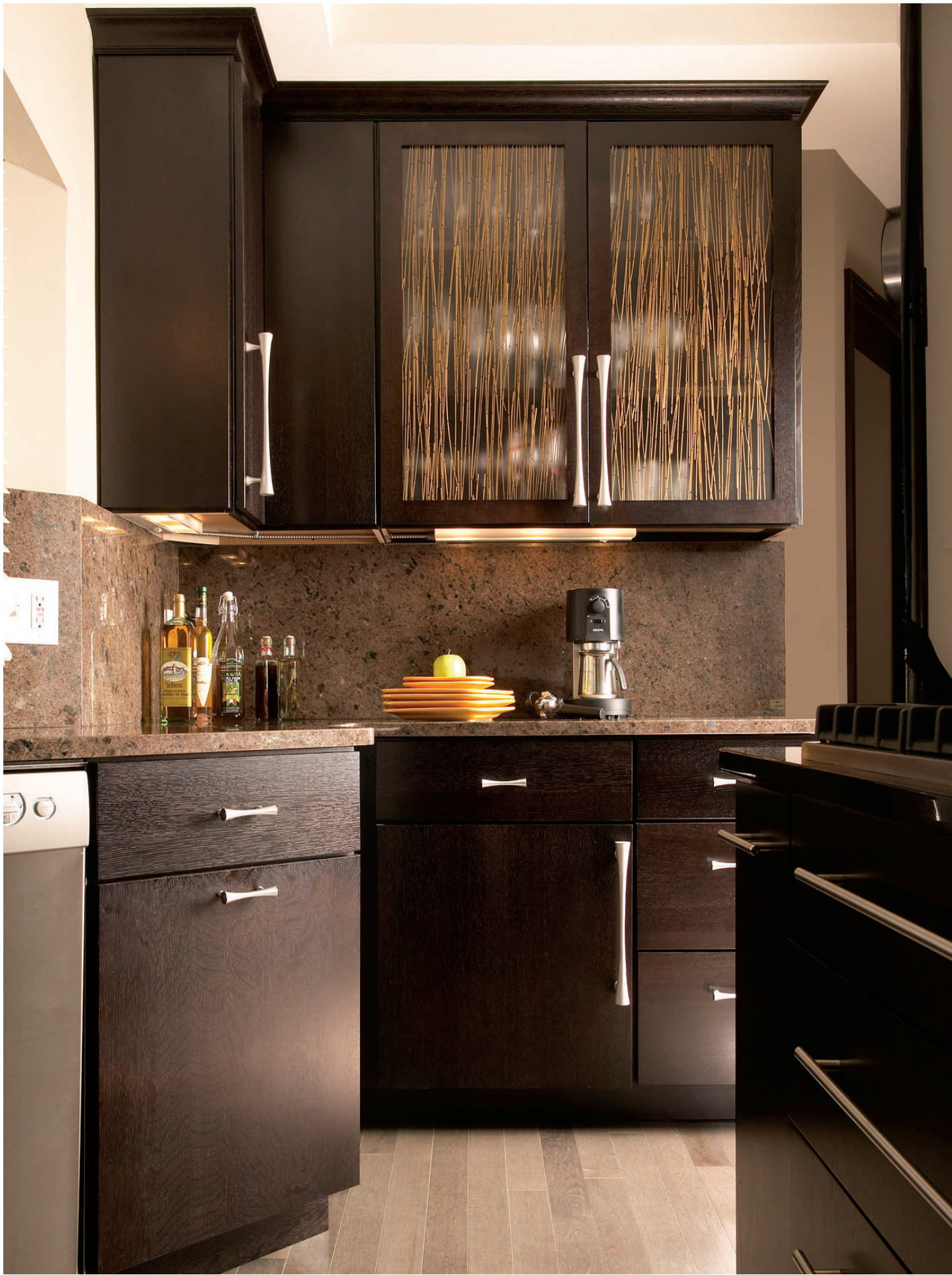
Cameron door, A-edge shape, Slab drawer, Quarter Sawn White Oak, Espresso