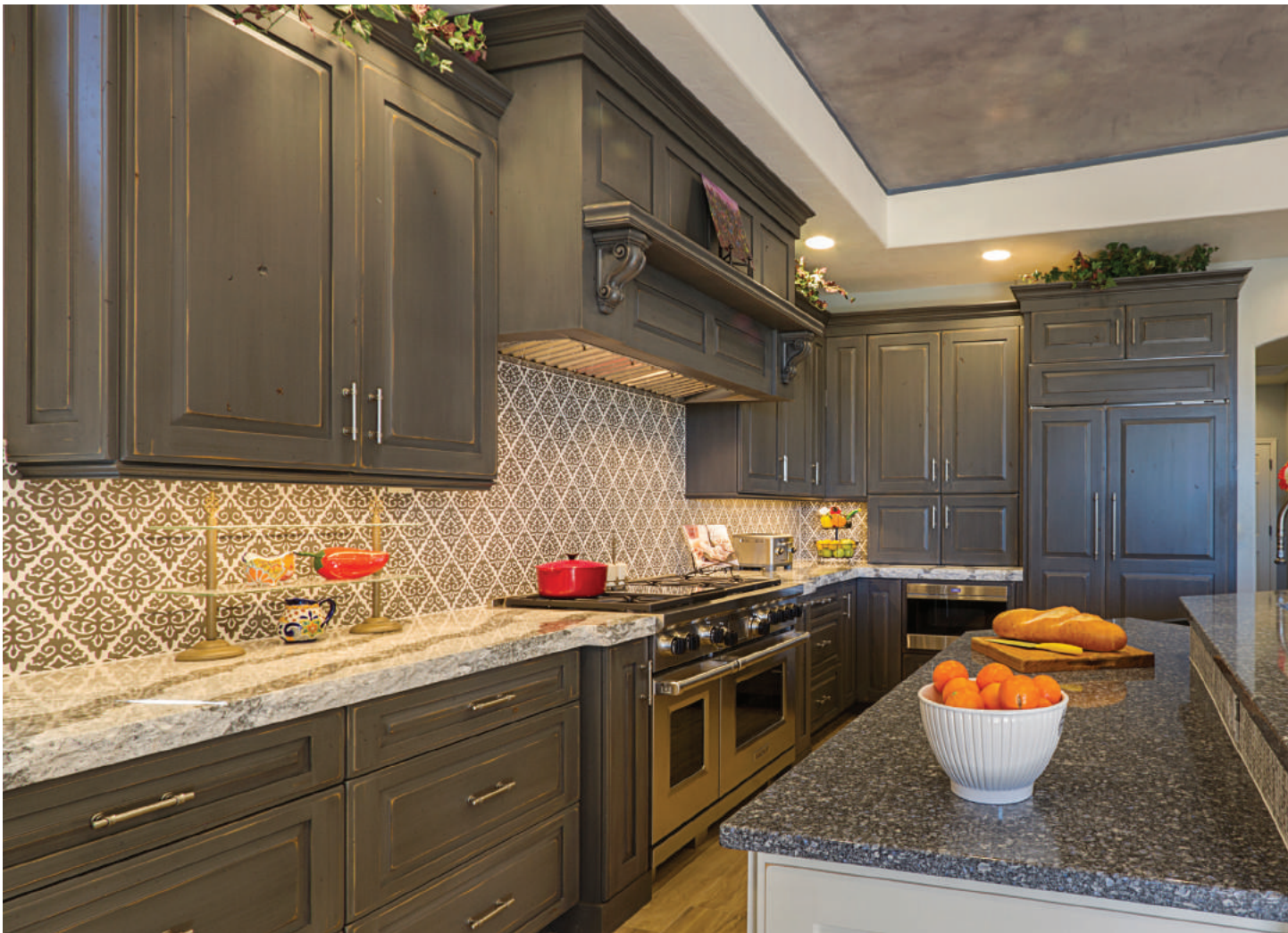
Portsmouth door, D-edge shape, Manor Raised drawer, Knotty Alder, Sawyer Smoke Stack