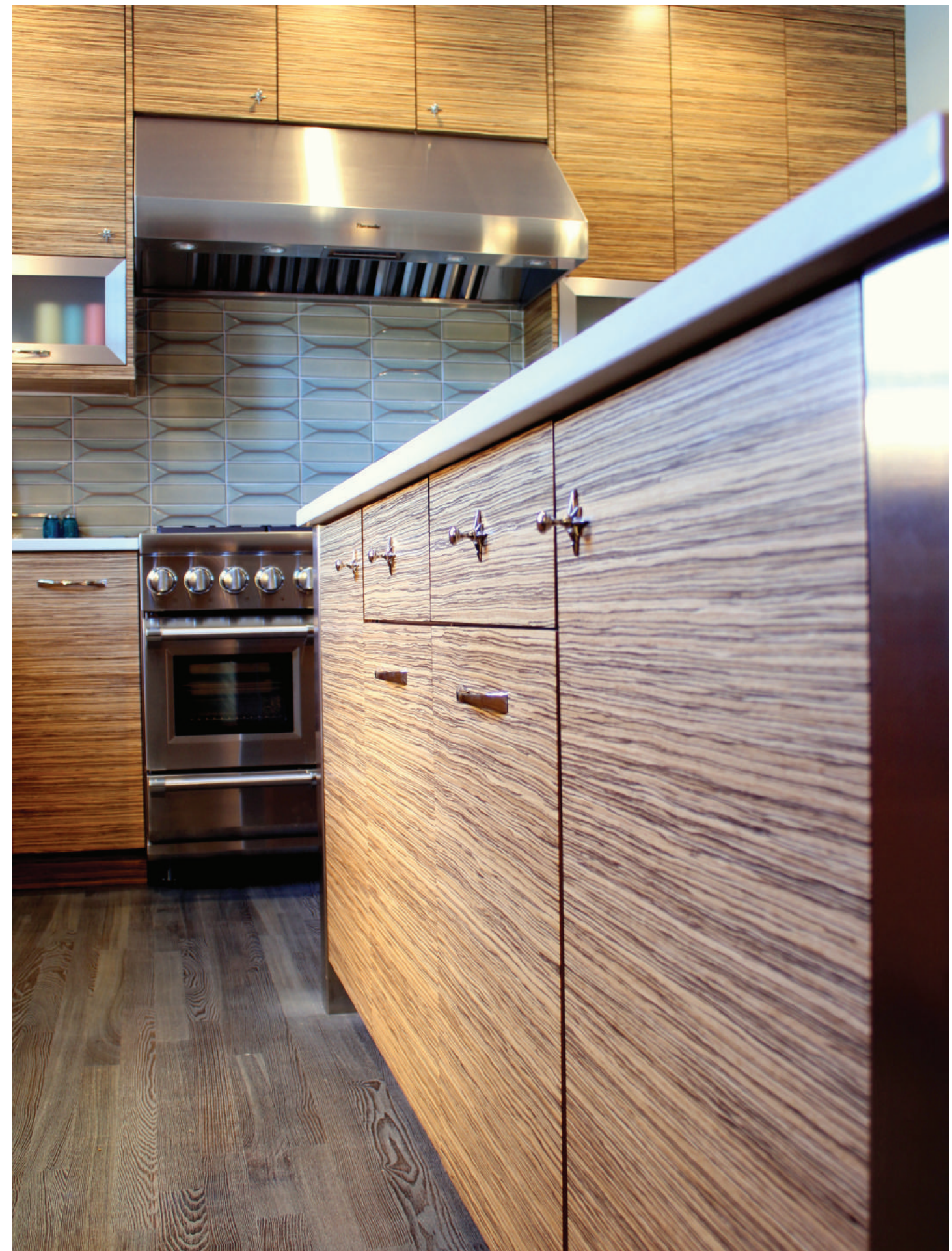
West End Elite door, Unique edge shape, Slab drawer, Reconstituted Zebrawood, Natural