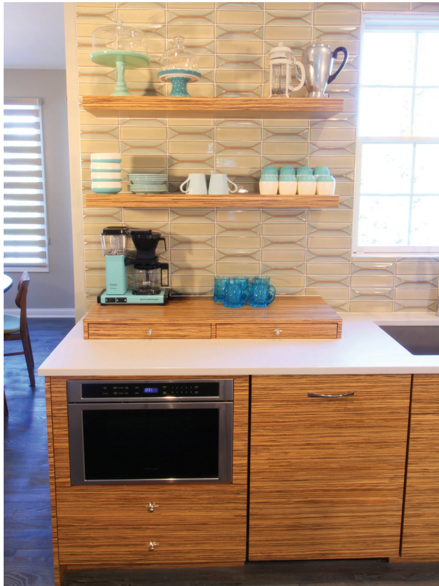
West End Elite door, Unique edge shape, Slab drawer, Reconstituted Zebrawood, Natural