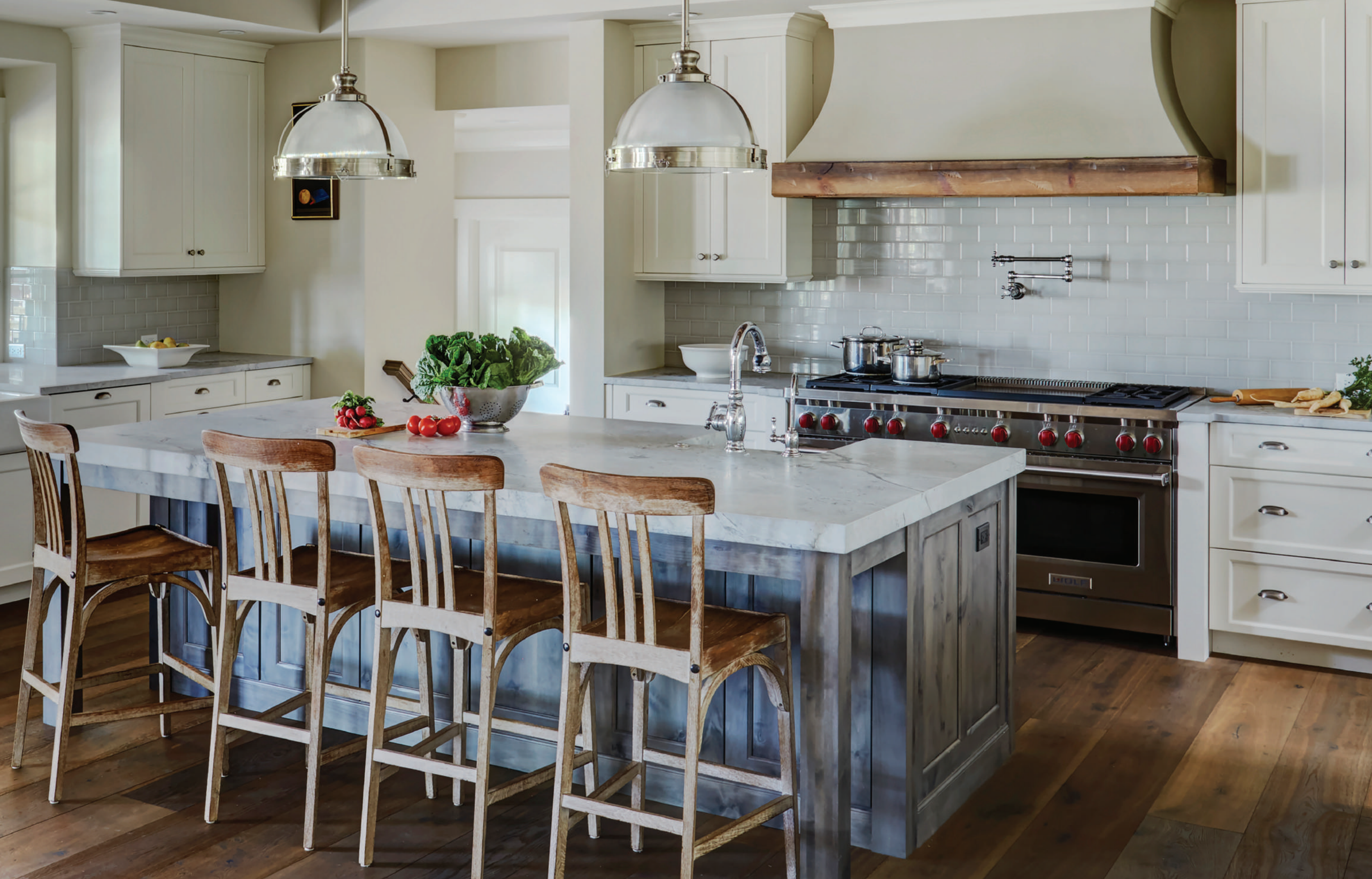
Perimeter Cabinetry: Oxboro door, A-edge shape, Manor Flat drawer, Maple, White Dove (Frameless) Island: Oxboro door, A-edge shape, Manor Flat drawer, Knotty Alder, Weathered Silverwood (Flush Inset)

Design by: Vine Street Design