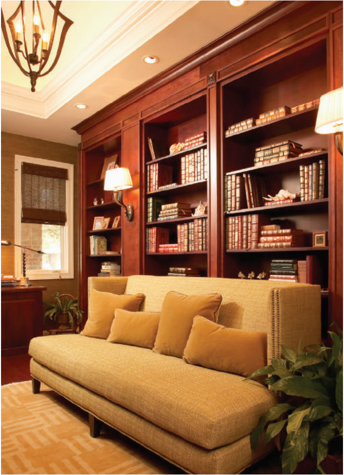
Cherry, Vineyard library shelves