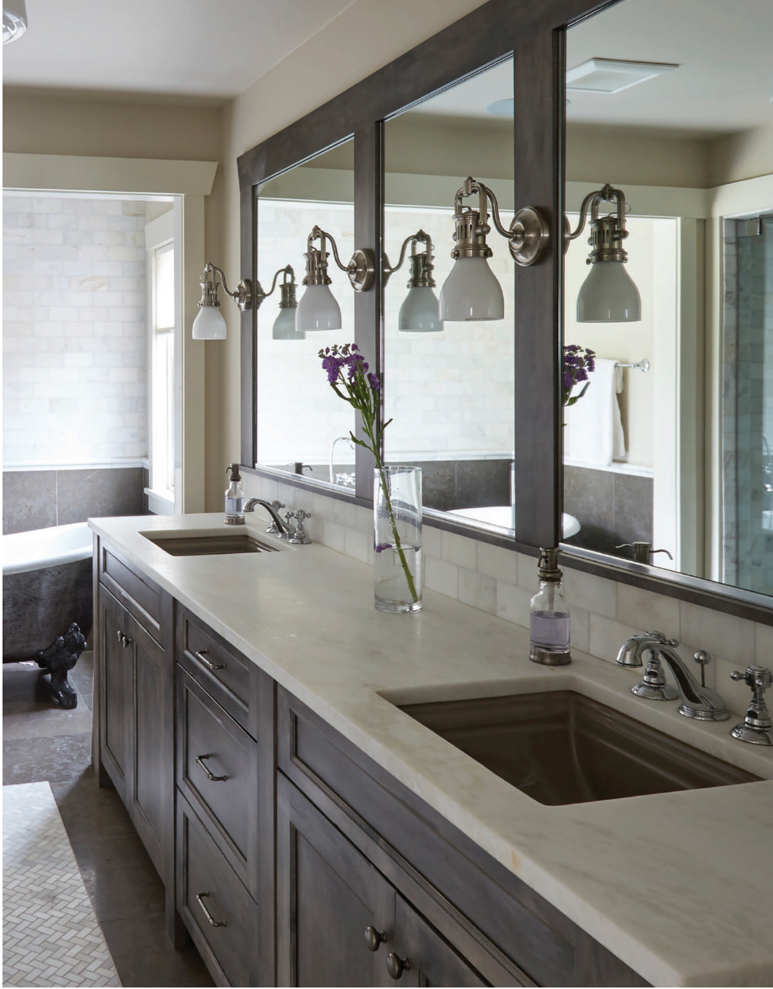
Seabrook door, Double Hip profile, A-edge, Manor Flat Drawer, Knotty Alder, Weathered Silverwood (Frameless)