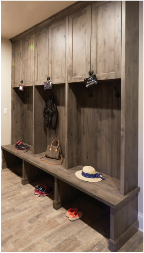
Seabrook door, Double Hip profile, A-edge shape, Knotty Alder, Weathered Silverwood (Frameless)