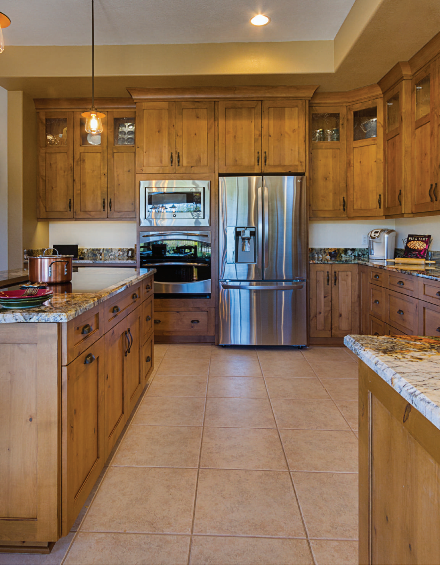
Seabrook door, S-edge shape, Manor Flat drawer, Knotty Alder, Rustic Timber