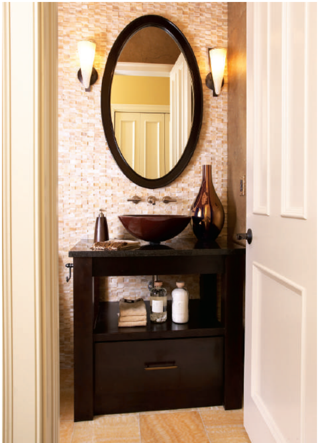
Cameron door, A-edge shape, Slab drawer, Cherry, Espresso