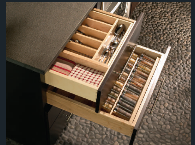
Cutlery Tray/Spice Tray