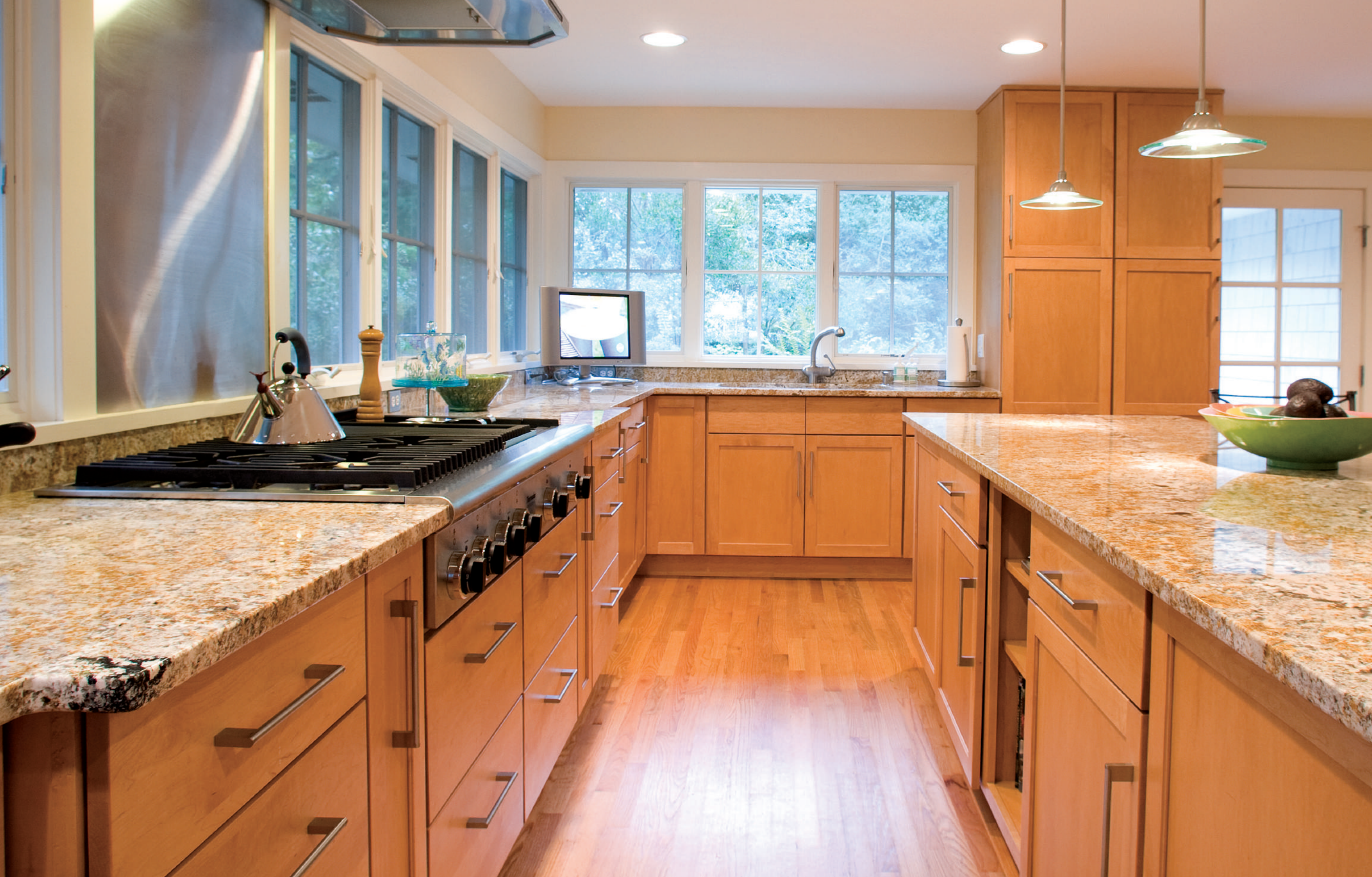
Madison door, A-edge shape, Slab drawer, Maple, Honey (Full Overlay)