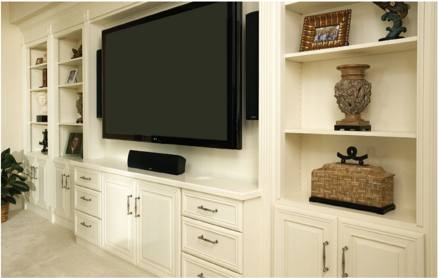
Georgetown door, Unique edge shape, Manor Flat drawer, Coastal White