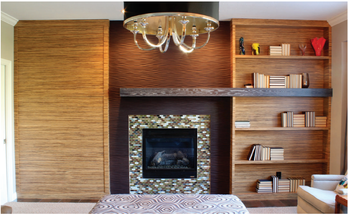
Reconstituted Zebrawood, Natural (Frameless)