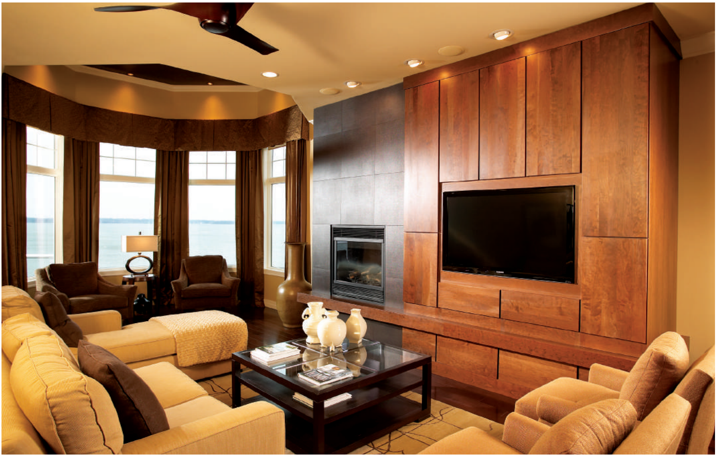
Cameron, A-edge shape, Slab drawer, Cherry, Walnut