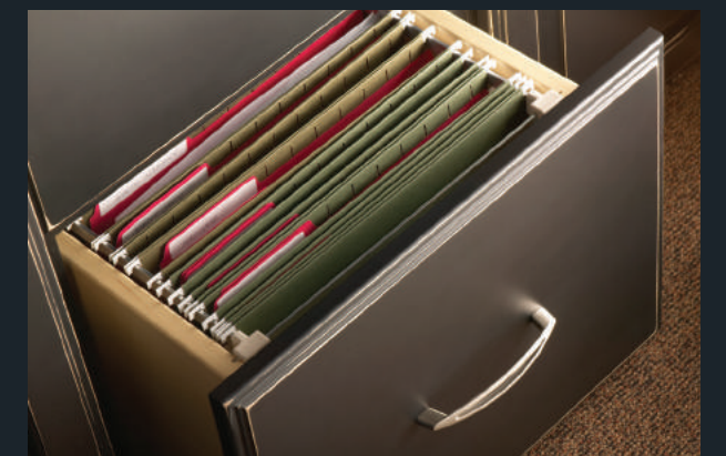
Integrated Filing System