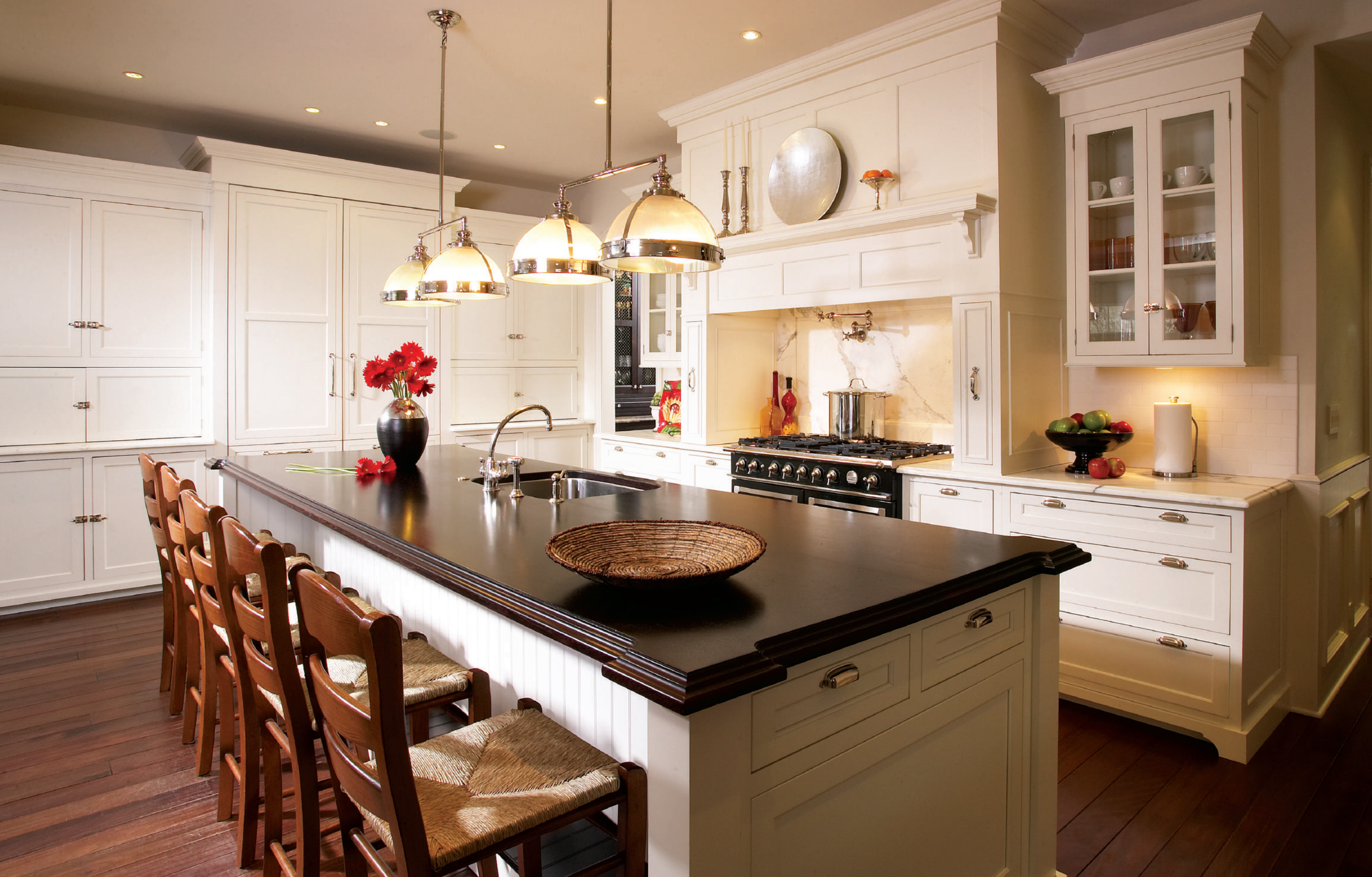
Madison door, Standard Hip profile, A-edge shape, Manor Flat drawer, Coastal White (Flush Inset)