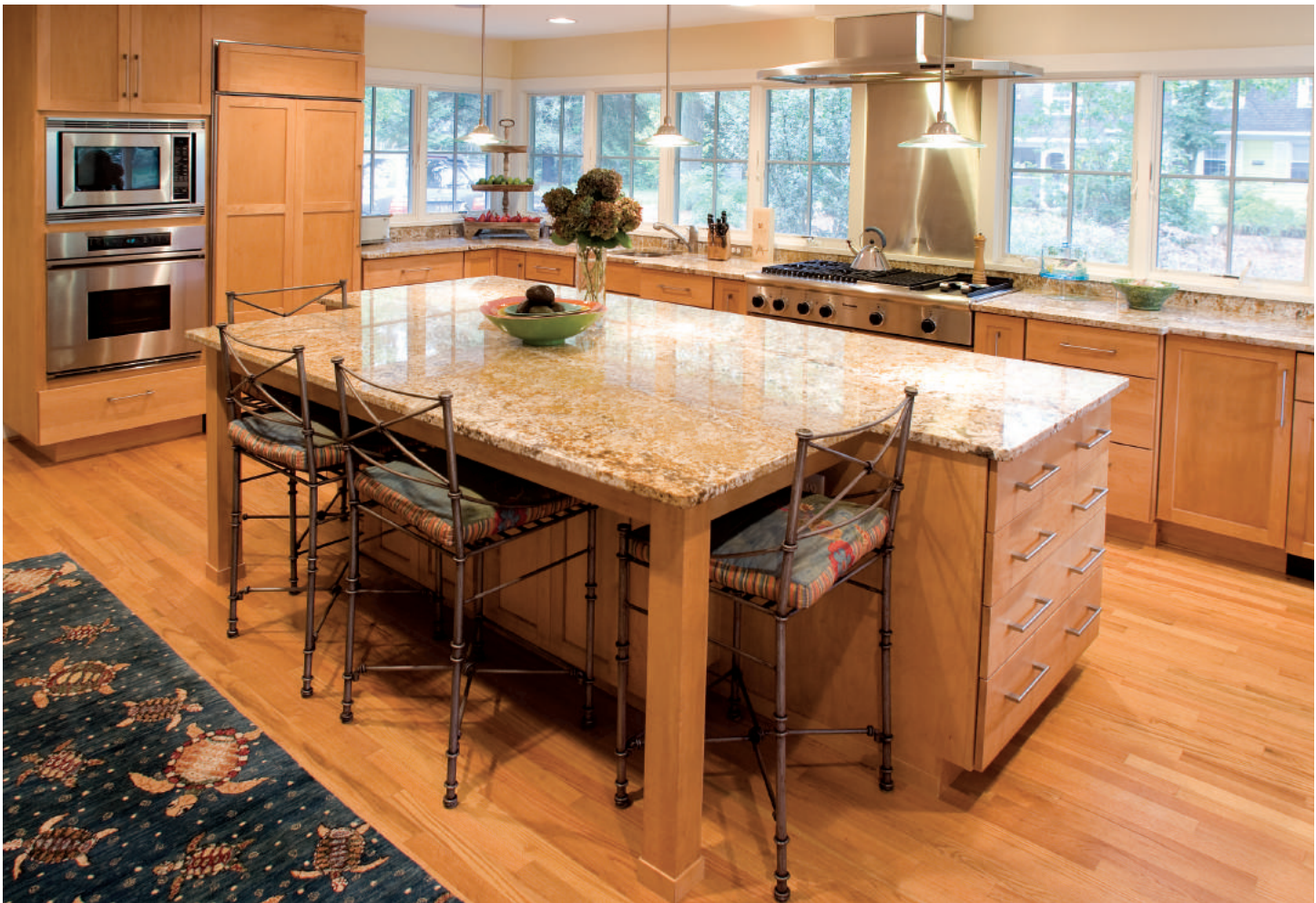
Madison door, A-edge shape, Slab drawer, Maple, Honey