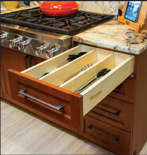
Adjustable Drawer Partitions