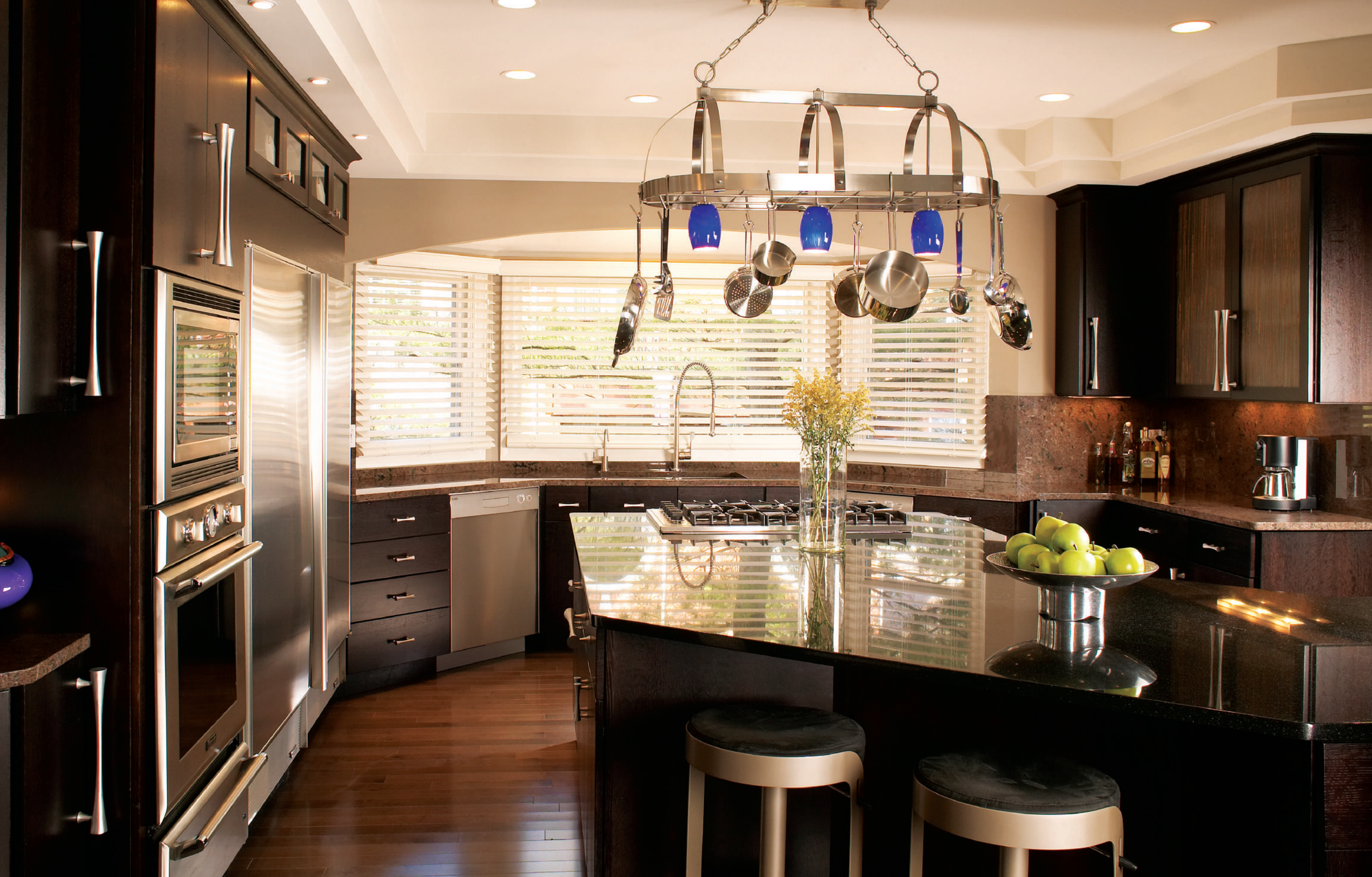
Cameron door, A-edge shape, Slab drawer, Quarter Sawn White Oak, Espresso (Full Overlay)