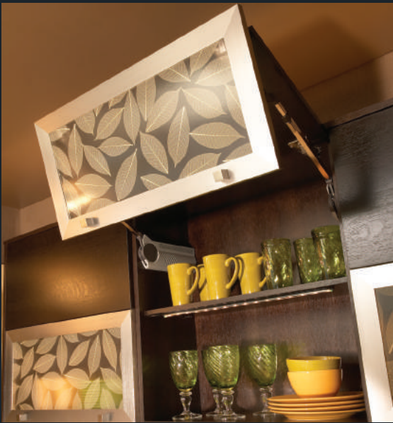
Bi-Fold Flip Up Lift System