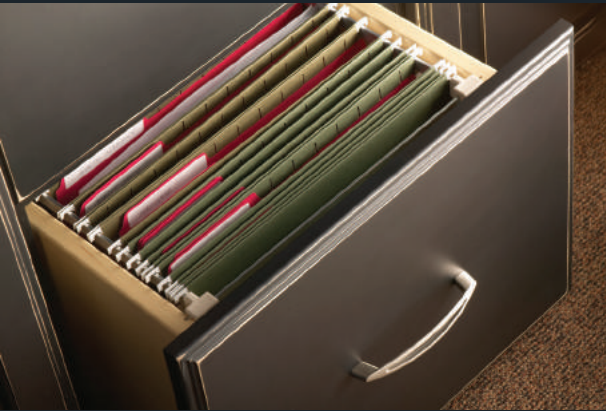
Integrated Filing System