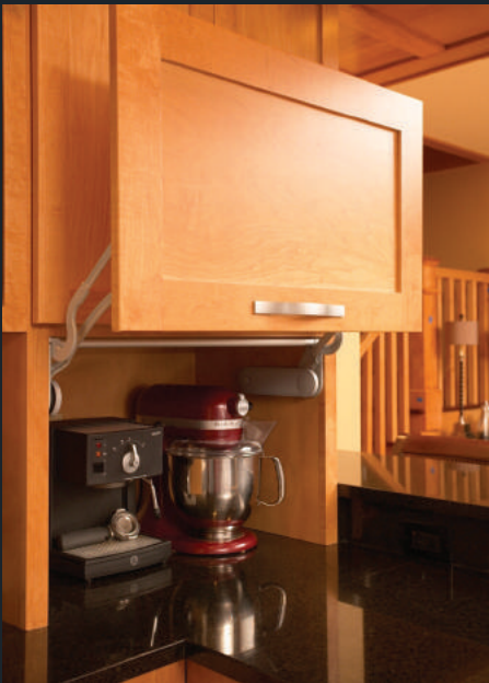
Appliance Garage Lift Up System