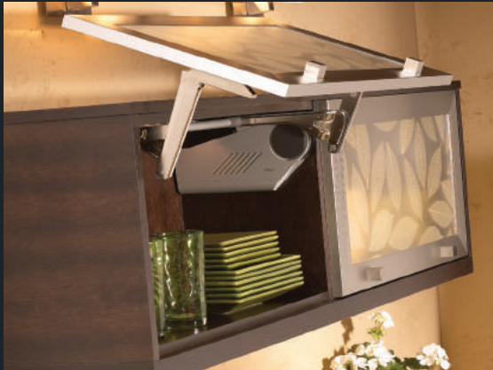
Up and Over Lift System