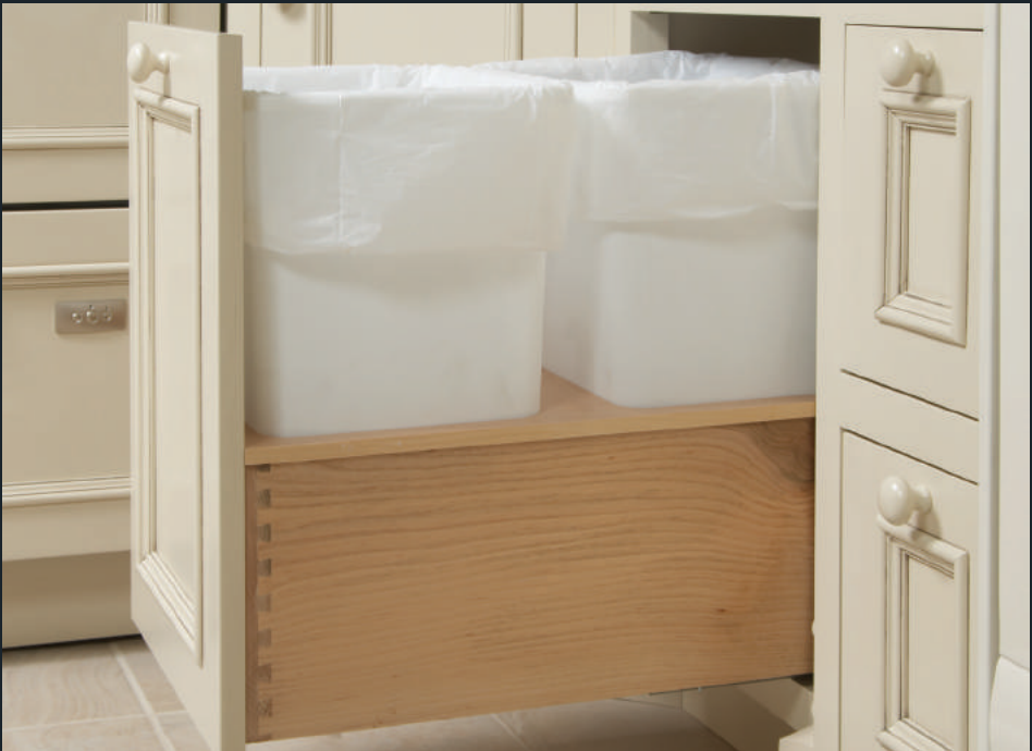
Double Roll-Out Waste