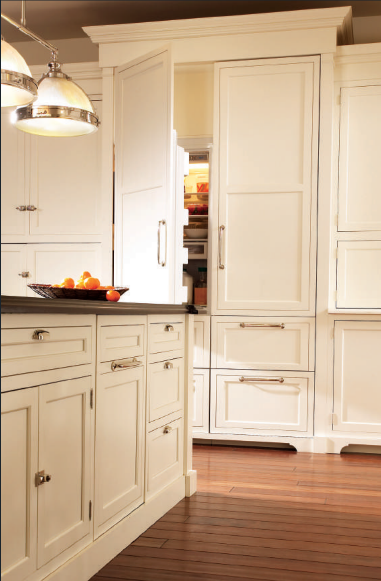
Integrated Appliance Panels